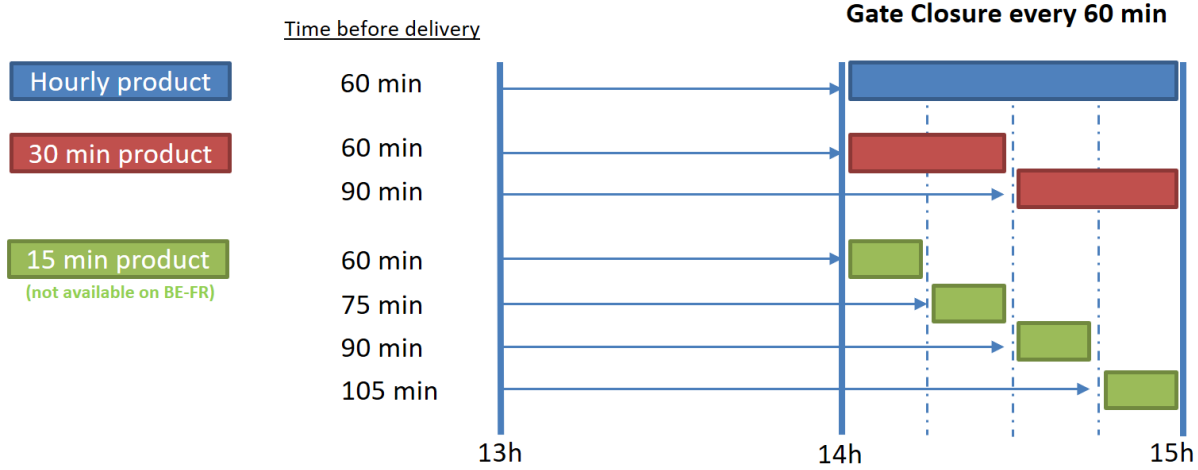
Figure 1 - Illustration of 15, 30 and 60 minutes products with 24 gates on BE-FR, BE-NL and DE/LU-BE borders as of 10 December 2020